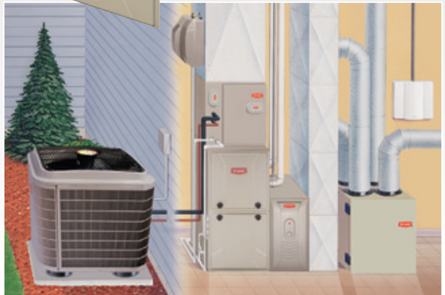
HYBRID HEAT® Deluxe Heat Pump and Deluxe Gas Furnace System