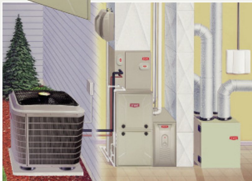
HYBRID HEAT® Deluxe Heat Pump and Deluxe Gas Furnace System