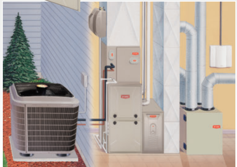
HYBRID HEAT® Dual Fuel Heat Pump and Gas Furnace System

This Box is to be used as a knock-out for a non-varnished area on a full-spread, full-bleed varnish plate.