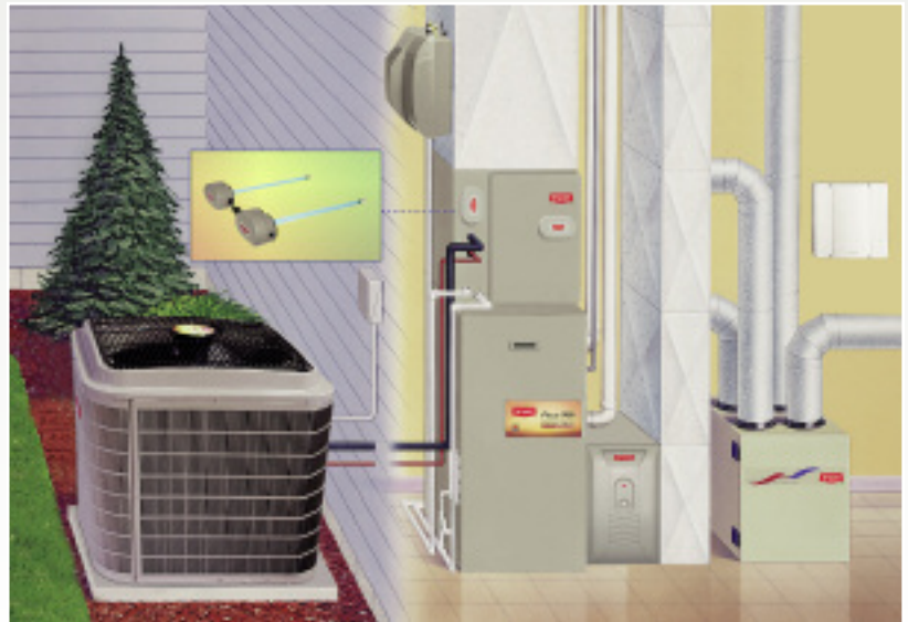
Air Conditioner and Gas Furnace System