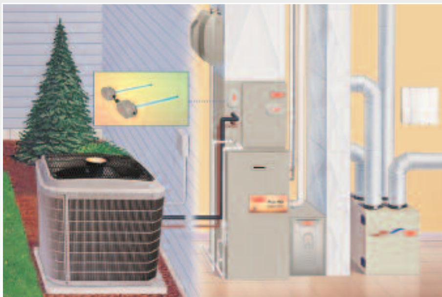
Air Conditioner and Gas Furnace System